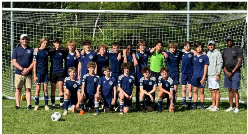
The U15 boys in the final spring season. Ten of the players in the last season were with the team five or more seasons.