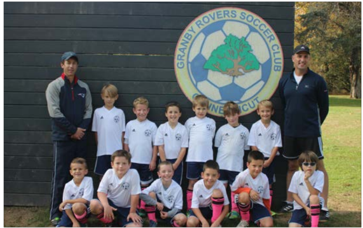
The U15 boys as 2nd graders. Seven of the original 12 played in the last game this season.

The advice I have already offered them is to work hard and that work needs to come from them in season and off season - during practice and the time they put in when not practicing. They need to own their growth now.